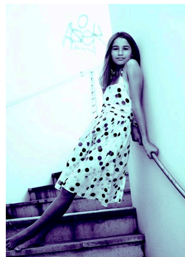
Split Tone 2